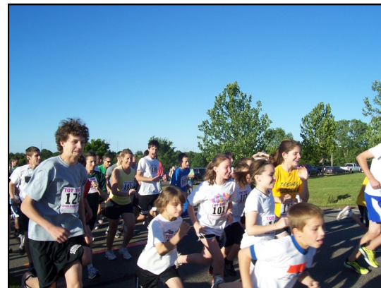
Starting line for the 5K

Mark your calendars for May 2011. We will announce a date soon!