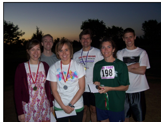
A few of our 5K winners